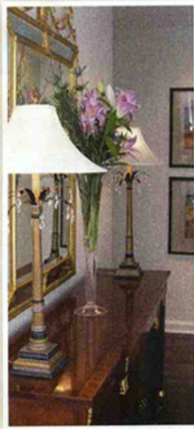
THE PANORAMIC VIEW , top, from Doug Ashenbach's downtown Columbus condominium at the Condominiums at North Bank Park was a certain draw for him. The photo resulted from blending together multiple separate pictures using a software program. They were taken at 8 a.m. March 21. Above, a welcoming entryway.